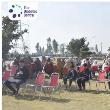
Free Diabetes Screening Camp Barkhiya Town, Charsadda