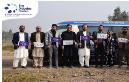
THE DIABETES CENTRE CHARSDA

TDC strengthened its Charsadda expansion through support from Barkhya Builders, including land and space for a satellite clinic to improve local access to diabetes care.