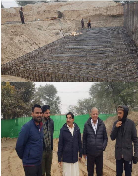
TDC Sahiwal Hospital construction and site visit.

Healthcare for tomorrow starts today as TDC begins construction of its new hospital in Sahiwal, bringing world-class diabetes care closer to South Punjab.