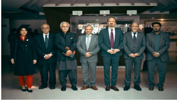
Academic delegation visits to strengthen research, training and clinical collaboration.