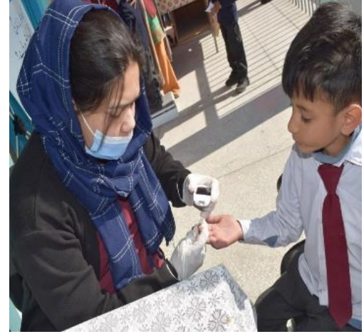
School screening camps for Type-1 diabetes awareness and early intervention.