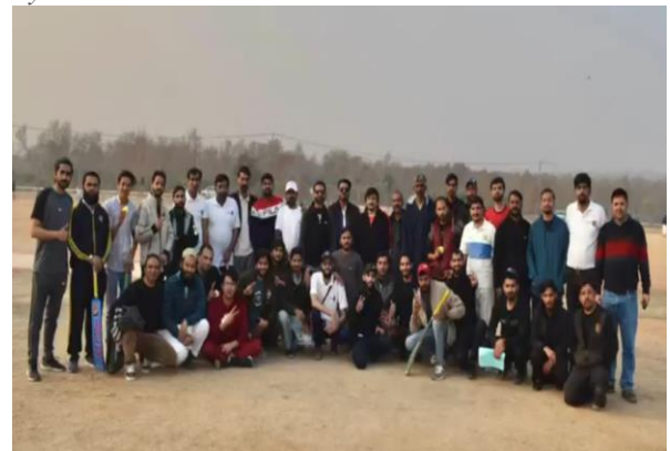
TDC Sports Gala Week: team-building, wellbeing and staff engagement.

TDC's Sports Gala Week brought staff together through cricket, football, badminton and team challenges, promoting workplace wellbeing, morale and a shared spirit of service.