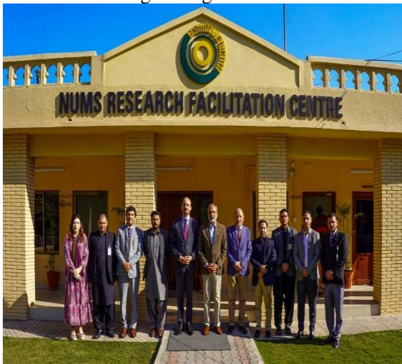
MoU with NUMS for research, clinical trials and capacity building.

An MoU was signed with NUMS to collaborate on research, clinical trials and capacity building, supporting the development of future healthcare leaders and strengthening TDC's academic role.