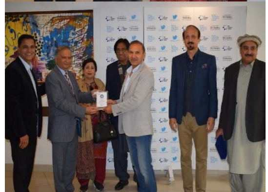
Medical delegation visits and collaborative engagement at TDC.