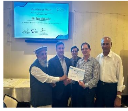
Fundraising and awareness events across Pakistan, Australia and the UK in support of TDC Sahiwal Hospital.