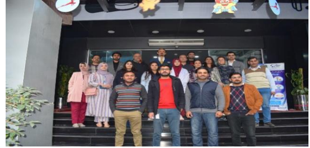
Diabetes screening and health awareness camp at Jazz HQ.

In March 2024, The Diabetes Centre organised a series of fundraising and awareness events in Brisbane, Islamabad, Wollongong and Manchester, uniting communities across Pakistan, Australia and the UK. From gala dinners and iftar gatherings to community health programmes, these events raised support for the upcoming TDC Sahiwal Hospital while spreading vital awareness about diabetes prevention and care. Distinguished guests, medical experts and community leaders joined hands with TDC, reaffirming their shared commitment to ensure that no deserving patient is left untreated.