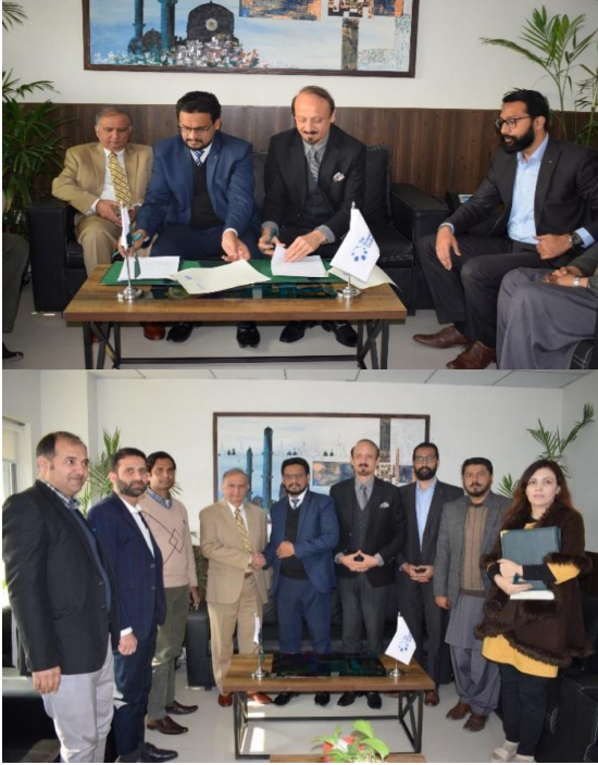
MoU with Askari General Insurance for affordable diabetes care.