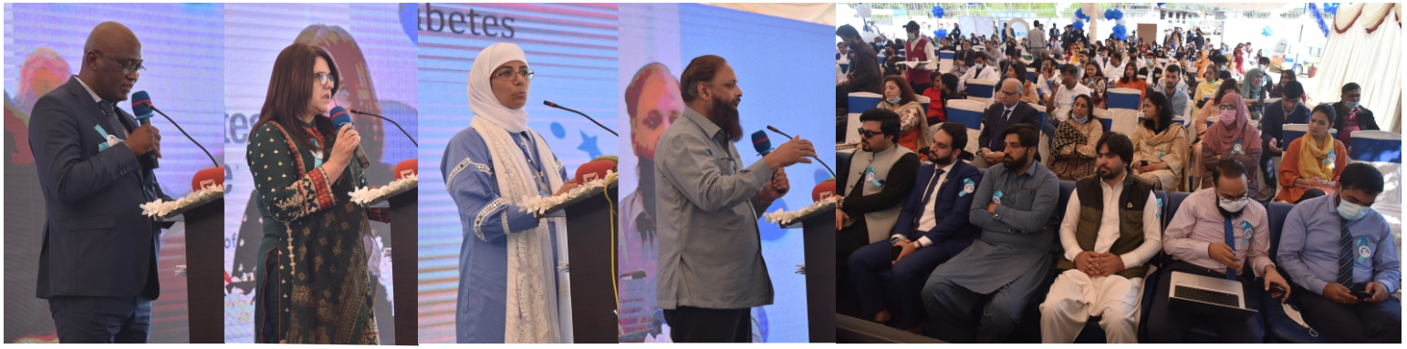
ICRC, Ministry of Health, TDC and WHO representatives sharing their views to the audience on World Diabetes Day.