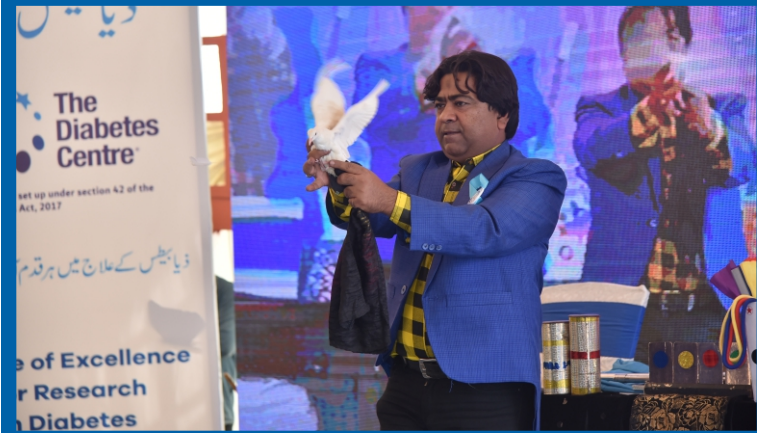
Magician performing in World Diabetes Day celebration.