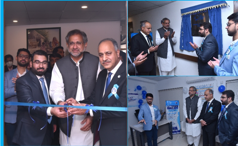
Mr. Shahid Khaqan Abbasi cutting ribbon on Inauguration Ceremony of Obesity Clinic

Obesity affects a large swath of the world. It is an epidemic that is getting more serious every day. Nowadays, obesity is a big problem in the society. It is not just a cosmetic concern, but also a risk factor for health issues such as heart disease, diabetes, and high blood pressure. Recently, The Diabetes Centre launched The Obesity Clinic inside the centre to prevent people from this kind of non-communicable disease. It also intends to help people who want to lose their weight and guide them about balanced diet.