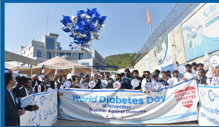
CEO TDC leading Diabetes Awareness Walk.