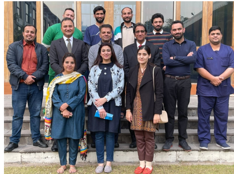
Group photo of TDC and ICRC officials at training session for Diabetic Foot Care at Muzaffarabad

The Diabetes Centre and The International Committee of the Red Cross signed an MOU to support to Diabetes management Program in Muzaffarabad. Under this program The Diabetes Centre conduct capacity building training sessions for CMH, AIMS, LHWS, and Lab technicians of District Hospital, additionally the team of The Diabetes Centre aligned the assessment of the referrals hospitals, i-e AIMS (Abbas Institute of Medical Science) and CMH (Combined Military Hospital) along with the establishment and operationalization of the diabetic foot clinics at the both hospitals.