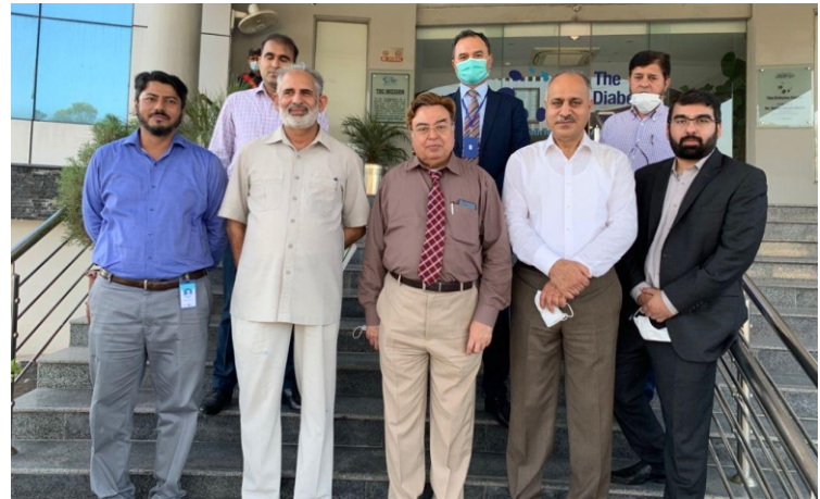
Group photo with DRAP officials

The purpose of establishing this centre at TDC is to provide latest medical solutions based on research to patients suffering from diabetes and its complications.