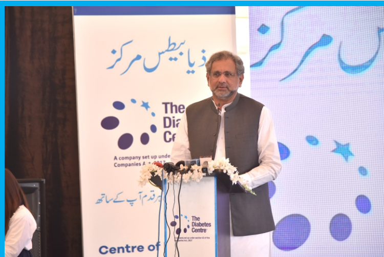
Chief Guest, Mr. Shahid Khaqan Abbasi addressing the audience of World Diabetes Day Celebrations.

World Diabetes Day is the largest diabetes awareness campaign around the world reaching a global audience of over 1 billion people in more than 160 countries. The campaign draws attention to issues of paramount importance concerning diabetes and brings diabetes education & awareness in the public and political spotlight.