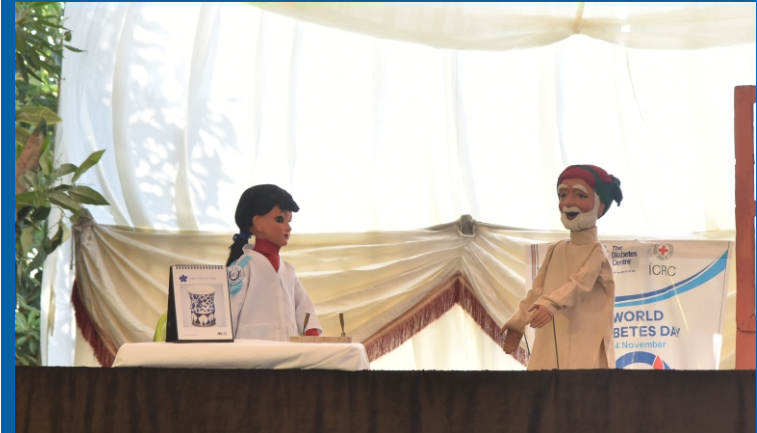
Puppet Show conducted by PNCA at World Diabetes Day.